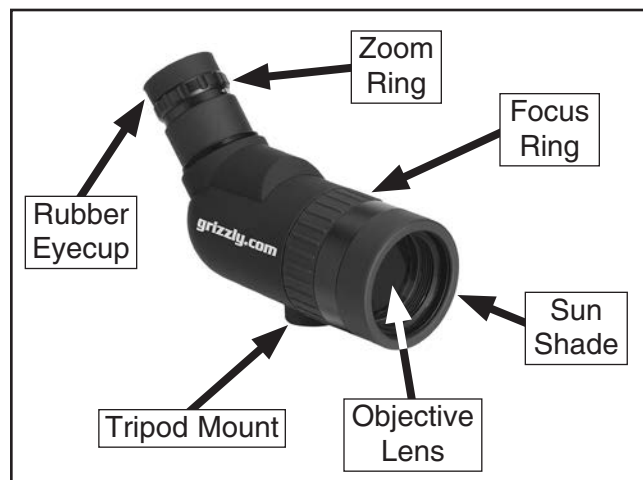
Figure 1. Model H8372 components.

Note: The edge of the rubber eyecup (see Figure 1 ) can be folded down to view the full field when wearing eyeglasses.